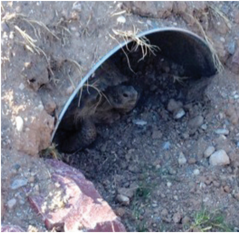
(pictured: Cottonwood Elementary tortoise habitat)